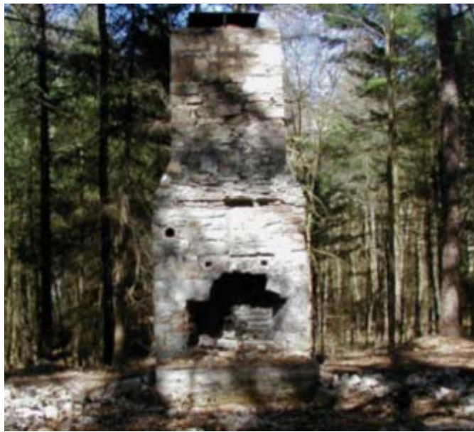
The chimney is all that remains of a cabin that Max Belding built using old tobacco barn timbers.

The 282-acre Belding Wildlife Management Area (WMA) contains a diverse mosaic of wildlife habitats including softwood and hardwood forests, agricultural fields, wetlands, streams and a pond. Cold springs feed the Tankerhoosen River which runs through the property. Hemlocks line the river keeping the water cool enough to sustain wild trout populations. The section of the Tankerhoosen River that flows through Belding WMA was designated a Class 1 Wild Trout Management Area in 1993, the first of its kind. Fishing and hiking are popular at Belding WMA. Connecticut Forest and Park Association maintains the Shenipsit Trail and the Belding Path as part of the blue-blazed hiking trail system. The Wildlife Division maintains an interpretive trail on the loop formed by the Belding Path and Shenipsit Trail.