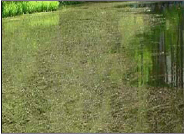
This is an example of an aquatic nuisance species (ANS) on Pickeral Lake in Colchester. You can help to prevent the spread of ANS through the tips in this brochure.