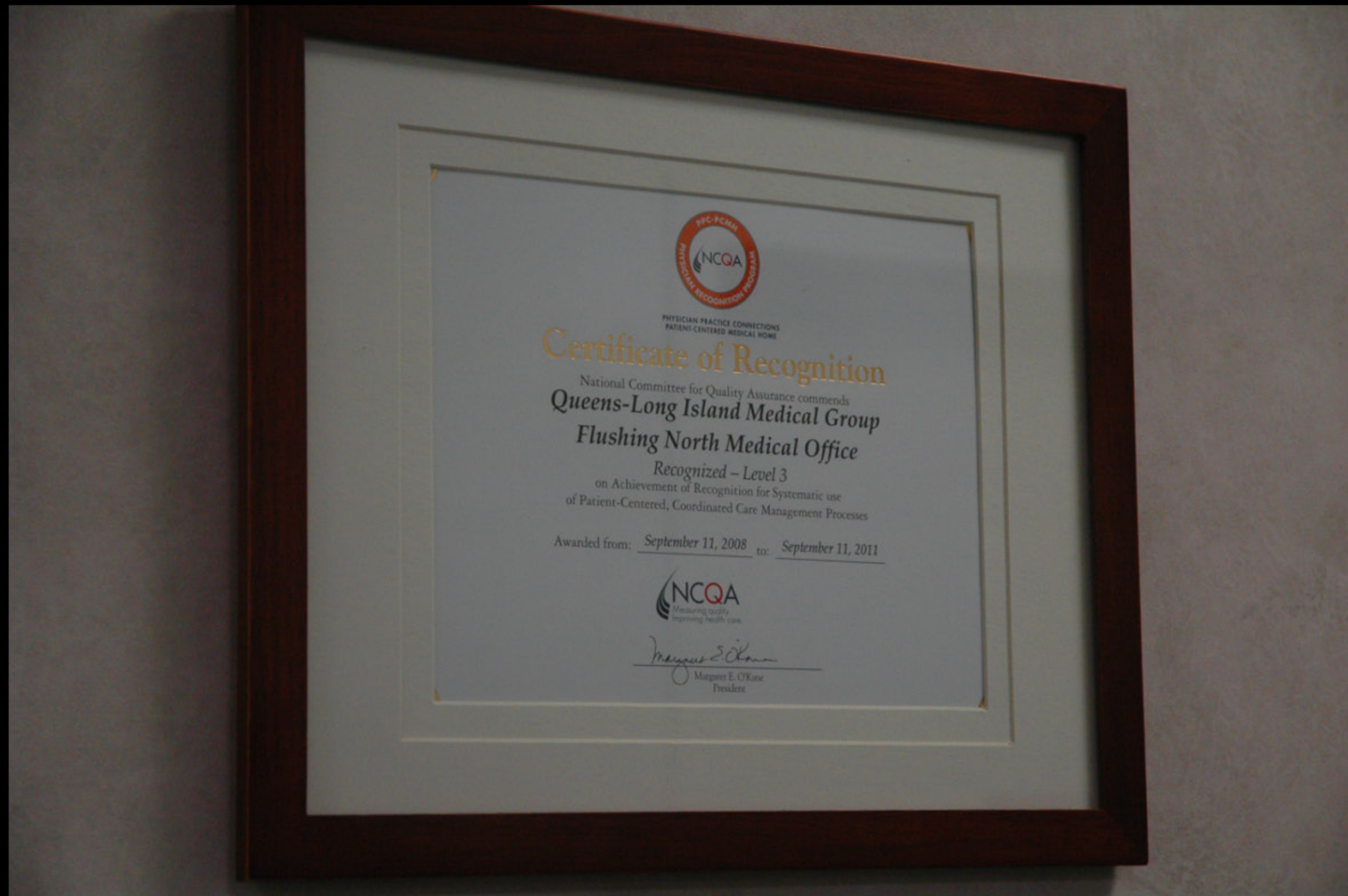
NCQA medical home certification