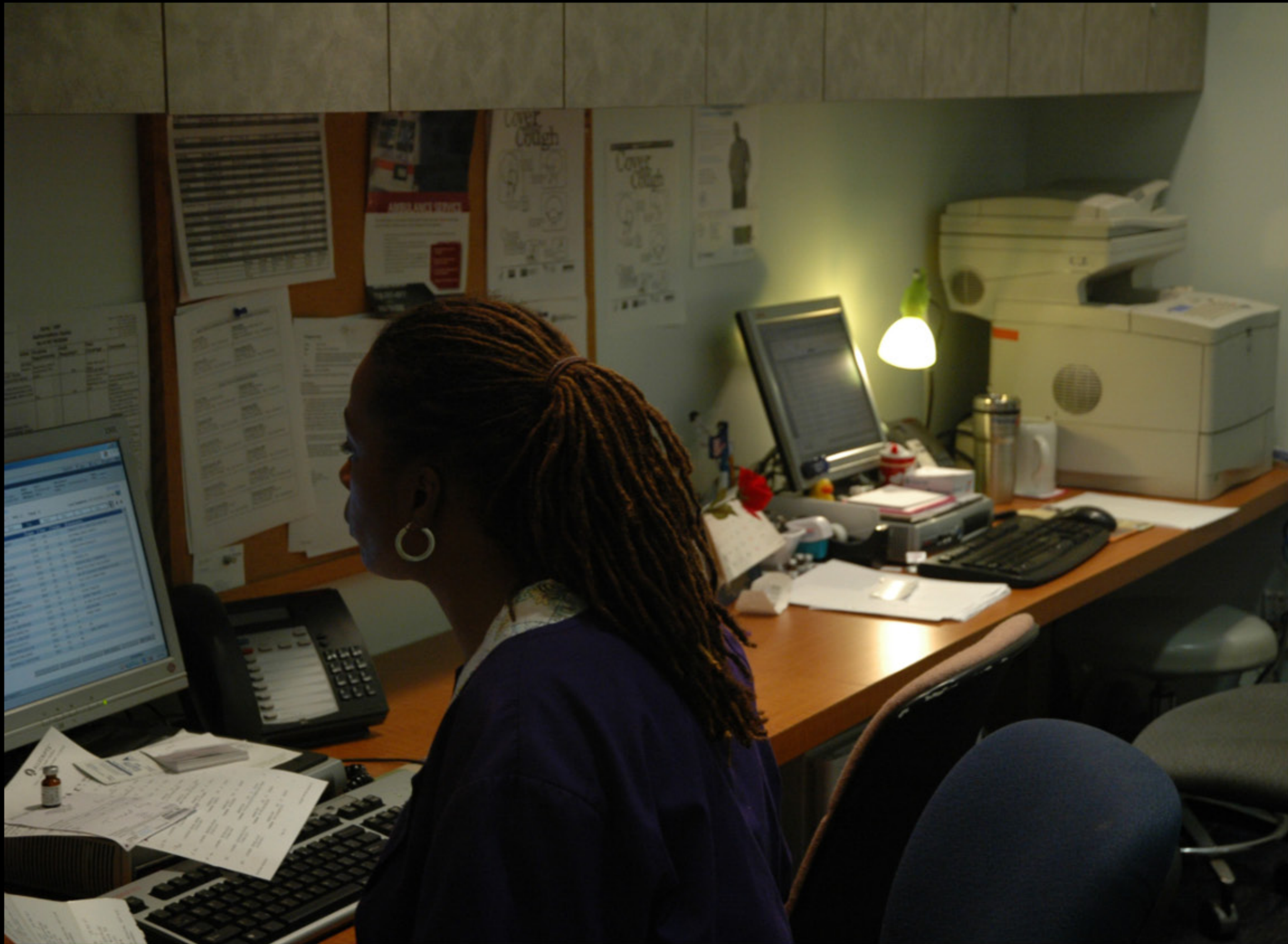
The nurses' space.