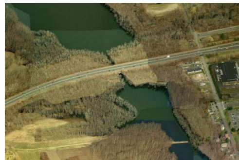
Top: Glastonbury Boulevard in the study area. Bottom: Keeney Cove and Route 3.

The study began at the end of 2012 with existing data collection, field reconnaissance, and Advisory Committee selection. It is anticipated the study will continue through 2013 and will include the following milestones: