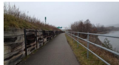
This shared use path is cut into the embankment along I-890 in Schenectady, NY. A path to the Putnam Bridge could have similar features along Route 3.

Coordination is on-going with Advisory Committee members in preparation for a January 2013 kick-off meeting.