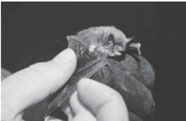
This Indiana bat, a state and federal endangered species, sports a new wing band that will help identify it in the future.

Wildlife Service, and U. S. Forest Service. In addition, some financial support is being provided under Section 6 of the federal Endangered Species Act, as the Indiana bat is listed as a federally endangered species throughout its range in the eastern half of the United States.