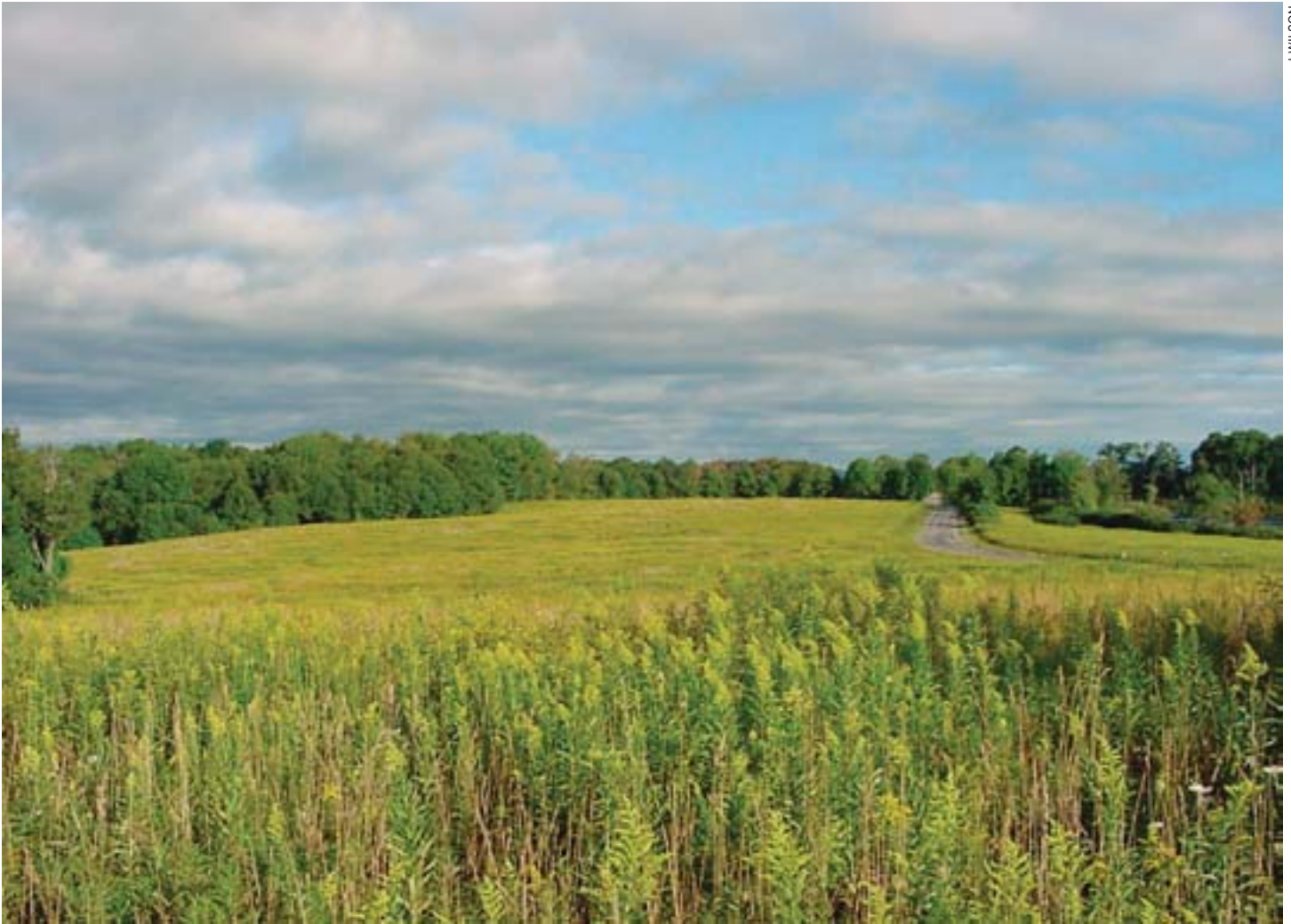
Landowner Incentive Program funds will be used to manage for high quality, privately-owned grasslands.

Imperiled Communities: Does the project manage/restore an imperiled community within a priority habitat?