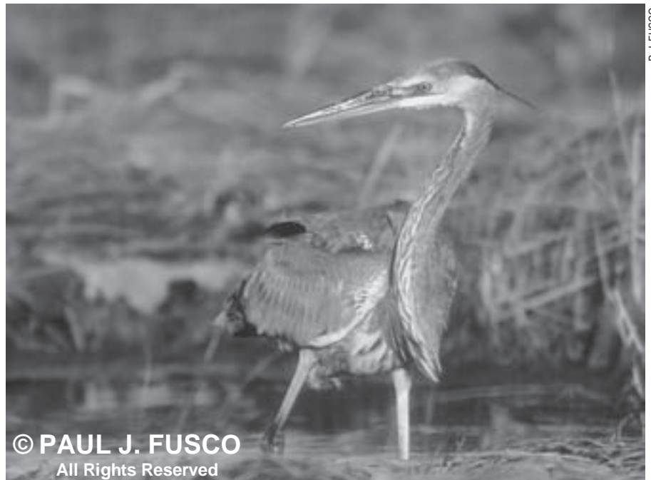
The great blue heron is just one of many waterbirds that can found in the diverse wetland habitats at Barn Island WMA.