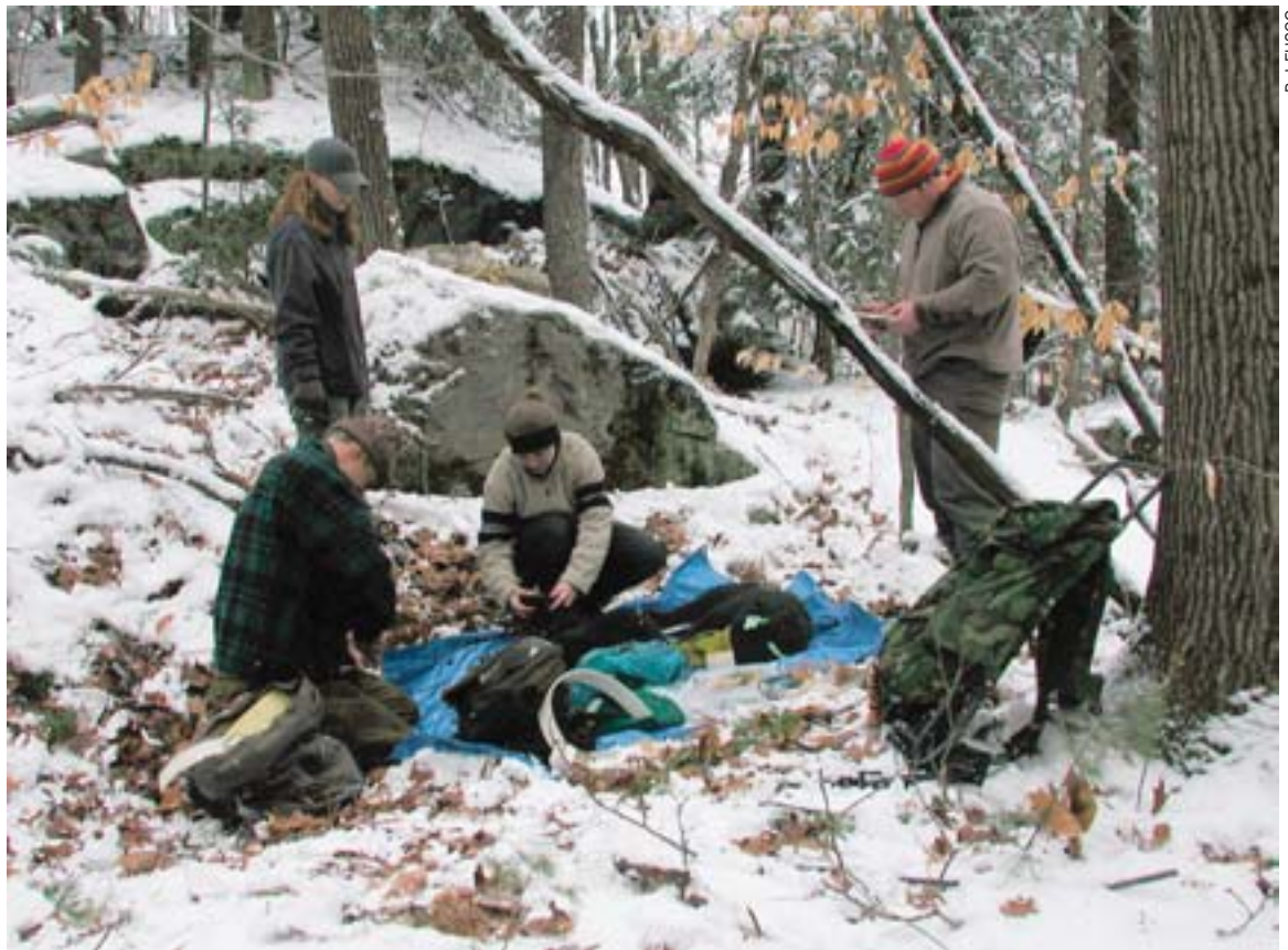
Two yearling bears are measured and tagged after being immobilized with drugs in their winter den. The adult female was also drugged, but remained in the rock den seen in the background.

The yearlings checked this past March will leave the sows by summer to go out on their own. The yearling males will