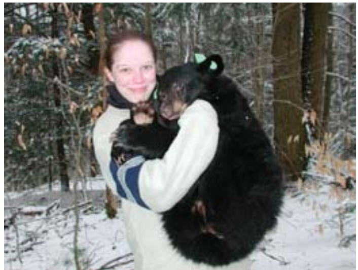
Before being returned to its winter den, this yearling was marked with ear tags. The tags help biologists identify the young bear after it becomes independent by summer.

vegetation, such as mountain laurel. One sow chose a hollow tree. Tree dens are not commonly used in New England but are used more frequently by bears in the southeastern states.