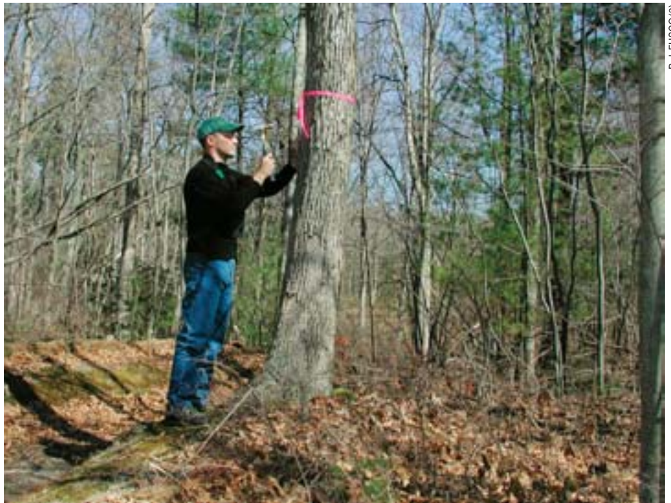
P. J. FUSCO(2)

Some of the more interesting reports from survey volunteers conducting the 2003 surveys included yellow-throated and warbling vireos, screech and barred owls, golden eagle, black vulture, and common raven, as well as northern parula, cerulean, worm-eating, Tennessee, hooded, blackburnian, pine, bay-breasted, Connecticut, and golden-winged warblers. Volunteers have observed