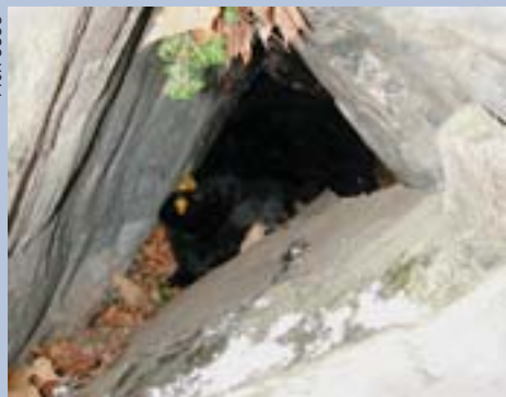
This tight enclosure, formed by rock slabs, served as a den for a sow and two yearlings.