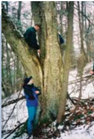
A young female chose this hollow yellow birch for a den.