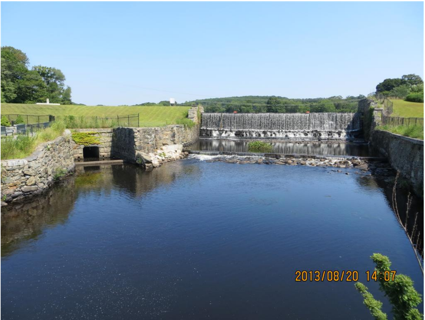
Ashland Pond Dam, Griswold

The Dam Safety Program will strive to maintain current and accurate records of submitted inspection reports and will issue the notices of the required inspections each January based on our best available data. Public Act 2013-197 requires that these notices be sent and that inspections are conducted at the intervals specified within the Inspection Regulation and that reports of those inspections be submitted to the DEEP.