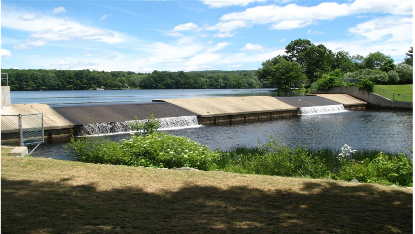
Quaddick Reservoir Dam, Thompson

This document is designed to assist the dam owner to better understand the state laws, requirements, responsibilities, and duties inherent with dam ownership and to assist the professional engineer by providing a consistent approach to dam inspection and the preparation and submission of reports and related documents to the Department of Energy and Environmental Protection (DEEP).