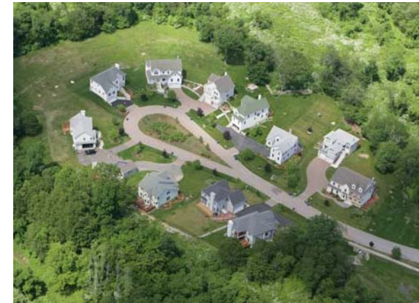
This neighborhood in Waterford, CT was constructed using multiple Low Impact Development techniques.