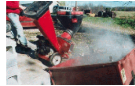
Figure 2. Onsite grinding of drywall

At new home construction sites ground gypsum drywall can be applied to the land surrounding the building site. Waste gypsum board needs to be pulverized in order to allow the drywall’s absorption into the soil. Pieces smaller than ½ inch sq. can generally be applied to the soil. The shredded gypsum drywall should be spread evenly over the soil and must be applied in areas with adequate drainage and aeration, so that no anaerobic reaction occurs. 63 Onsite application requires a mobile processing machine, as well as a mechanism to spread the shredded drywall.