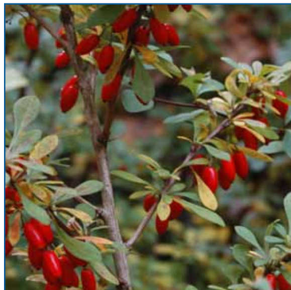
Japanese Barberry

A good method to keep invasive species from re-entering the area once removed is to plant native species in their place, such as northern bayberry ( Morella pensylvanica ), ink-berry ( Ilex glabra ), winterberry ( Ilex verticillata ), arrowwood ( Viburnum dentatum ), and mountain laurel ( Kalmia latifolia ). For advice on the control and disposal of invasive species, check out Guidelines for Disposal of Terrestrial Invasive Plants .