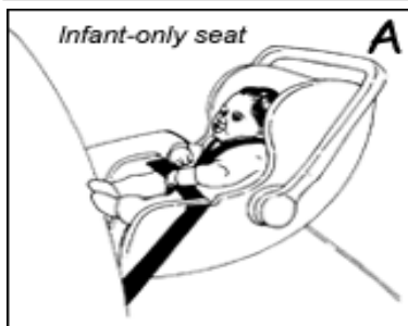
Infants under 1 year and less than 20 lbs. face rear only.